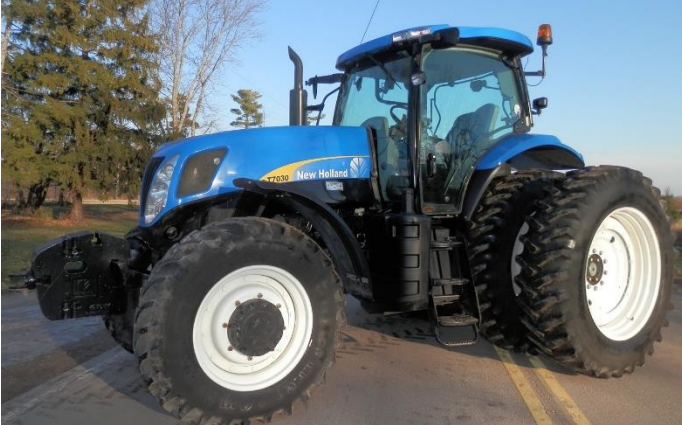
New Holland T7030 MFWD Tractor, Super clean dual door cab w/Buddy Seat, PS, LH Reverser, Roof Hatch, Sunscreen, and more. Tractor has Dual Rear PTO & 3 Pt. Control, TR, DL,540/1000 RPM, Foot Throttle, Roof Mt. Beacon, Swing Mirrors, Cold Weather Pkg., (10) 45 K6 Suitcase Weights w/Pin Tow Hitch, 18.4R-42 FS w/fenders. Tractor sells w/Onboard S2 Outback Guidance System. A very clean, 3940 hr. great cold weather starting & driving tractor, SN Z8BGT14767—check it out if you're looking for a clean low hr. value tractor.