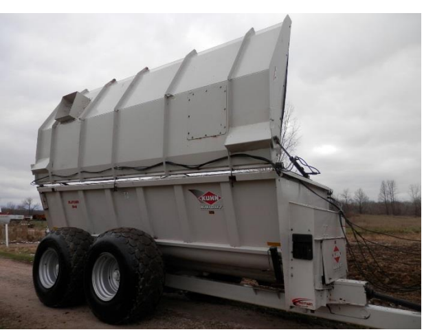
Kuhn Knight Pro Twin 8141 Slinger w/hyd. roof cover that has rear top fill and front option, lights, 28LL-26 Knobby Rubber, SN H0054—a very nice unit!