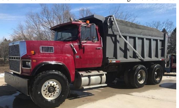
'88 Ford L9000 dump truck , Cat Dsl., clean cab, 10-spd. w/new McClam steel dump box, roll tarp w/grain door. Always stored, needs some minor repairs —estate.

Jamesway 5600 gal. manure tanker, rear discharge and good 60% rubber; 52' manure lagoon pump, tandem axle 8" discharge, single cannon—solid (Phil's Mfg. pump); 10"x30' portable fill stand w/loading lights and frame mt. parts basket. '96 IH Truck w/DT466 DSL Power & Knight 490 SS lined mixer, auto, rebuilt discharge. Special...'91 Muv-all 48' drop deck dove-tail semi trailer,