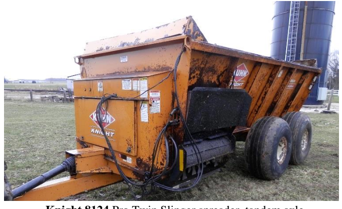
Knight 8124 Pro Twin Slinger spreader, tandem axle, 19L-16.1 FS Floaters, Lights; Knight 7725 Slinger Spreader, less than 100 loads use since dealer re-cond. & rebuild.--new hammers, extension, covers, & more! Nice estate item.

Val Metal Agri Chopper 5600 Tub grinder w/dual adj. bale stops,