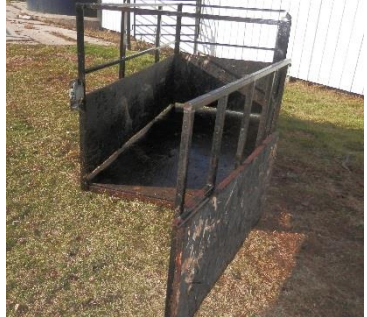
Miller 'N Co. Auctions & Appraisals, LLC

4'x8' Moo-ver, 4 ½' high, open-top calf hauler or lift cage. Has latching end door & pallet fork tubes in floor.