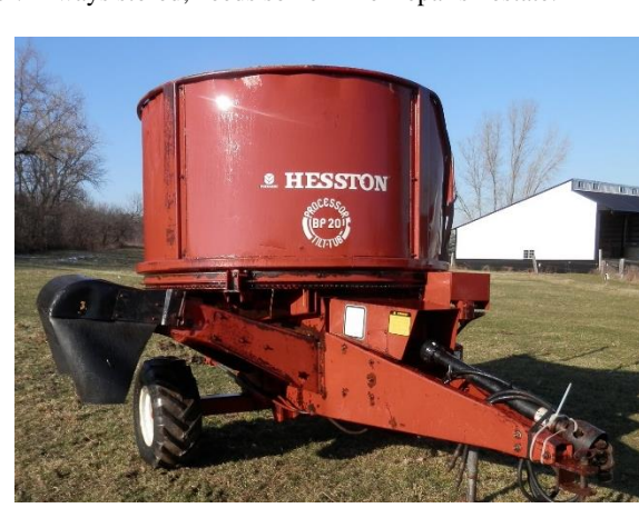
Hesston BP-20 Tilt-Tub bale Processor w/LH Self-loading, RH discharge throw or fold down deflector, 540 pto. This grinder has always been shedded and has seen less than 50 bales in the last 10 years-Excellent!

Select items to be offered live/online via Bidspotter.com TERMS: Cash, good check or if unknown to auction company, bank letter of credit with state issued ID must accompany payment. All items must be paid for at completion of sale and before removal. Number system will be used. All items sell as is, where is. All announcements sale day take precedence over all matters in print. Not responsible for accidents or merchandise after it is sold.