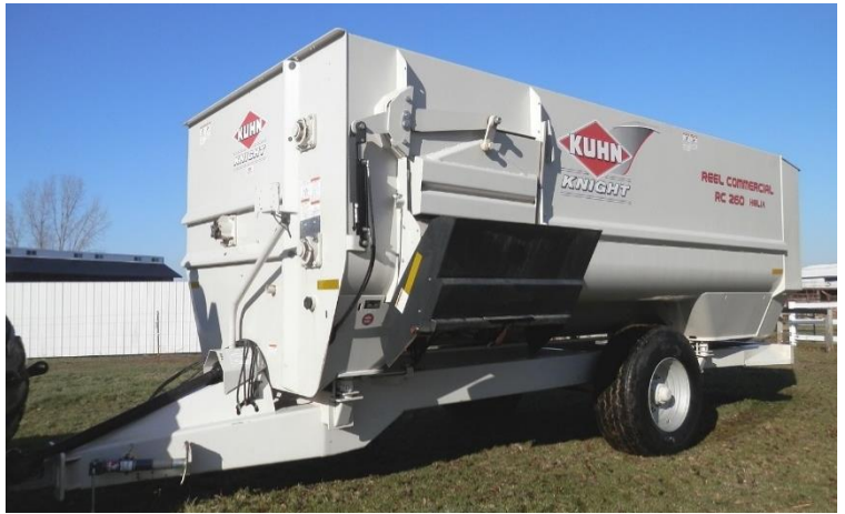
Kuhn Knight Reel Commercial RC260 Helix Mixer, LH Adj. Discharge Deflector, 425/65R 22.5 floaters, lights & very clean!